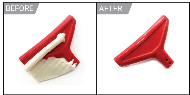
Before: FDM Technology, ABS Build Material, SR30 Support Material

PostProcess has developed the world’s only automated and intelligent solution to these problems, with a combination of unique technologies that will help unlock scalable industrial 3D printing.